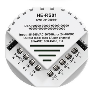
Figure 3: SmartStart QR Code & DSK